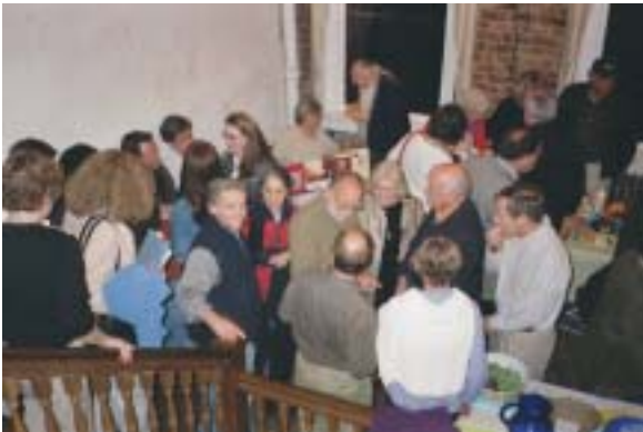
The Frost Place gratefully acknowledges the gift of free or discounted space to hold its On-the-Road Workshops by the following organizations: